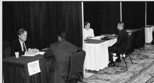
Attendees of the Legal Diversity Summit participate in interviews with Nebraska firms and organizations.

The fourth annual Legal Diversity Summit will be held on September 5, 2008 in Omaha at the Holiday Inn Convention Center. The Summit provides law students of color from the region with new education opportunities, contacts and interviews with